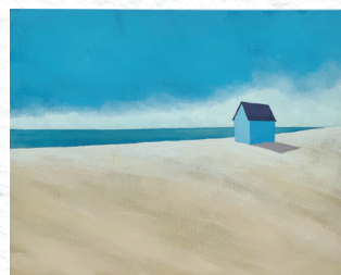
Dune Shack 41cm x 51cm €700