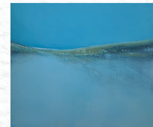
Burren 50cm x 60cm €1,150