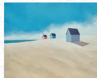
Dune Shacks 41cm x 51cm €700