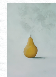
Yellow Pear 40cm x 30cm €500