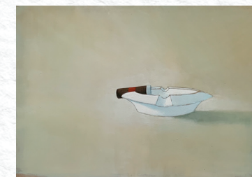
Long Ashes 51cm x 71cm €1,250