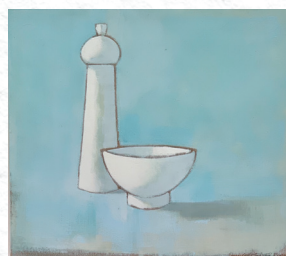
Still Life 36cm x 41cm €550