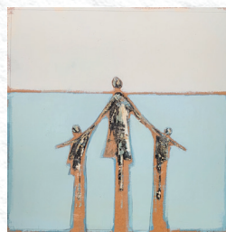
Mother and Children 41cm x 41cm €600