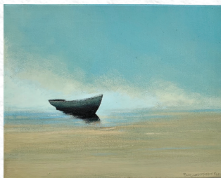
Boat 36cm x 46cm €600

+353 (0)86 844 8589 or info@thegallerykinsale.com