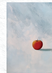
Red Apple 71cm x 51cm €1,250