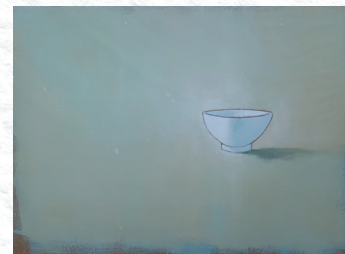
Bowl 51cm x 71cm €1,250